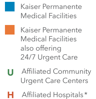
Map not to scale. Locations not exact.